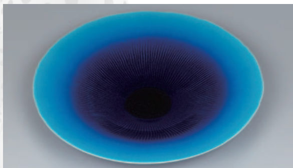
KIMURA Yoshiro Large bowl, ripple-mark pattern, cobalt-blue glaze 2009