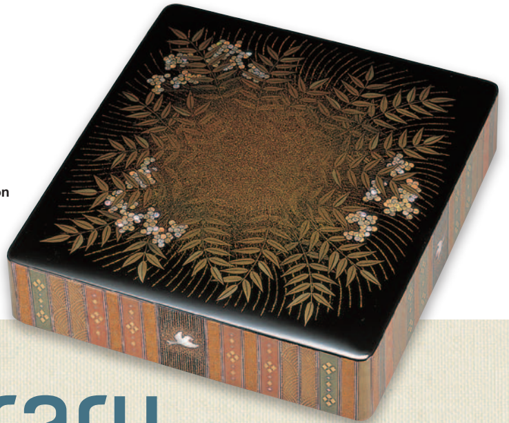
MUROSE Kazumi Box, "Red Light", maki-e, mother-of-pearl inlay 2004