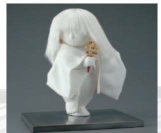
MEN'YA Shoho Prayer Dance 2008