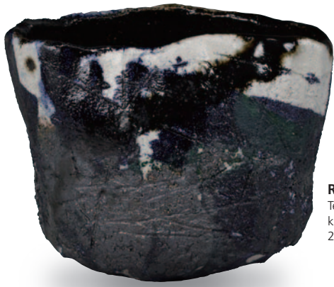
RAKU Kichizaemon Tea bowl, Raku ware, kuroraku type 2012