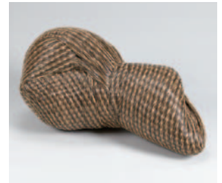
TANABE Shochiku Connection-Symbiosis 2013