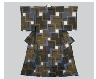
MORIGUCHI Kunihiko Kimono, "Shikishi Paper", yuzen dyeing 2006